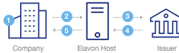
Figure 2-1. Authorization Process

The following diagram describes the electronic authorization process: