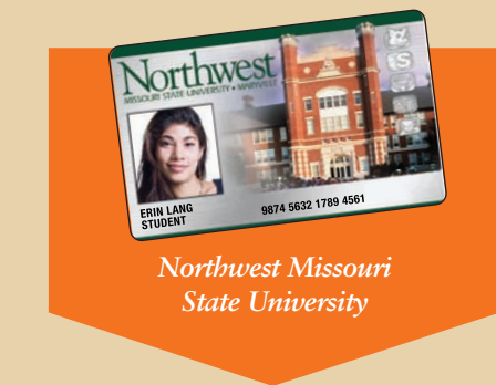
Northwest Missouri State University

“U.S. Bank has been a great partner! They were very helpful in getting our program launched and we have developed a great working relationship with them. The U.S. Bank team and their program has been an asset to our campus and our students. The staff is very easy and pleasurable to work with and the students are obviously excited by the benefits and their customer service since our numbers continue to climb each year.”