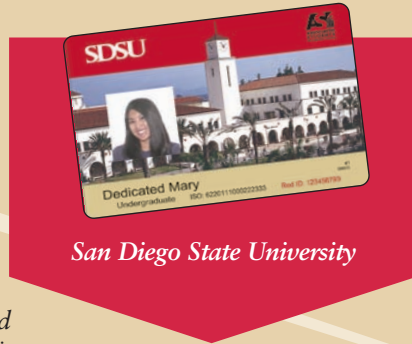
San Diego State University