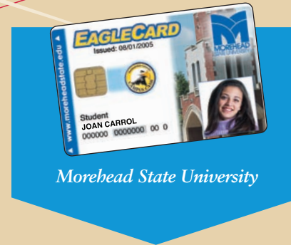
Morehead State University