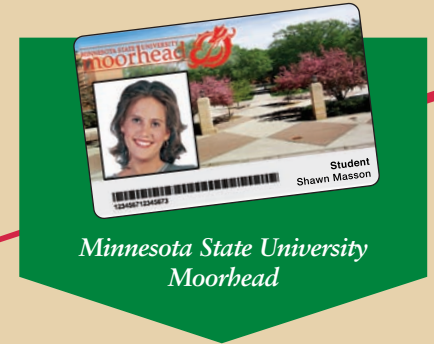
Minnesota State University Moorhead