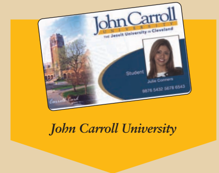
John Carroll University