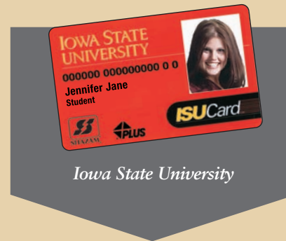
Iowa State University

“U.S. Bank is a great partner. The relationship Iowa State University has with U.S. Bank provides us with a mechanism to cut costs by direct depositing financial aid refunds and payroll to students and employees who have no other banking relationship.”